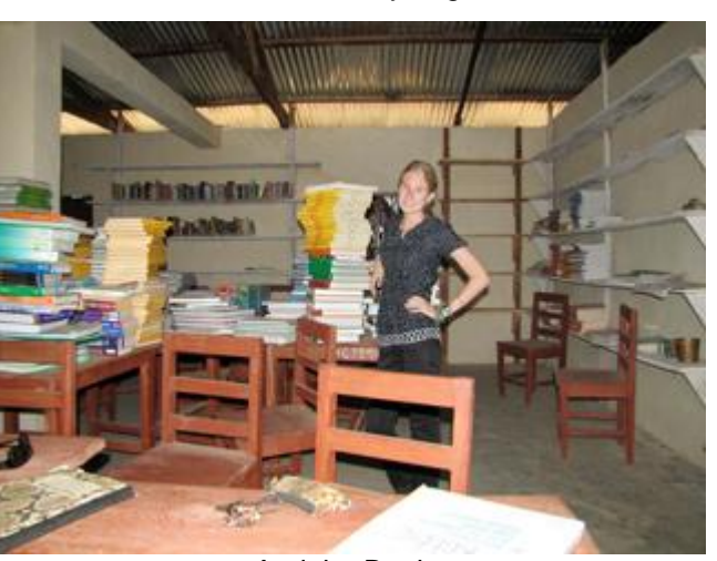
And the Books