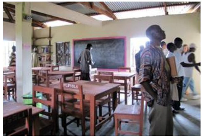
Then the community was invited inside