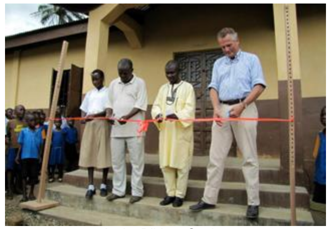
And a Ribbon Cutting