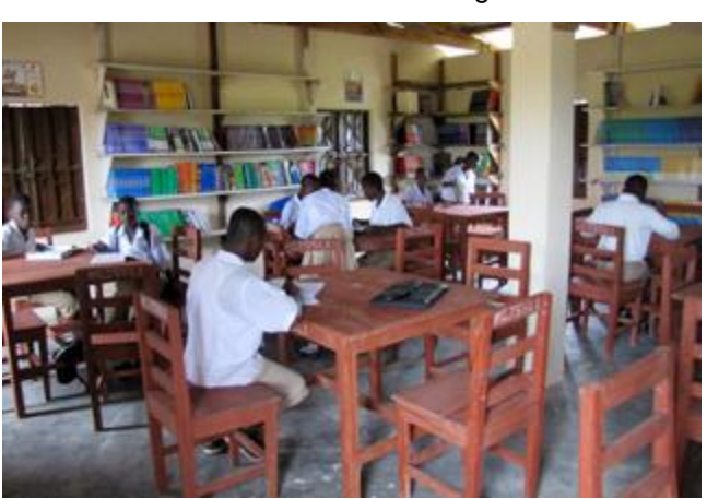
And the Library was Officially Open