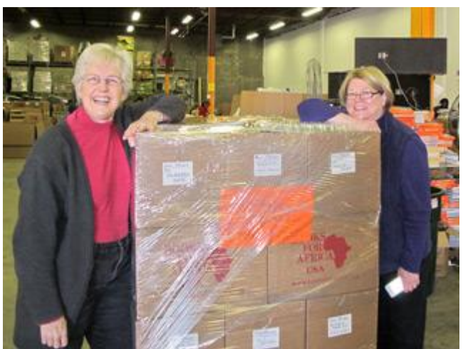
Pallets Ready to go