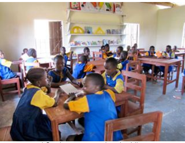
and Students were using the Library